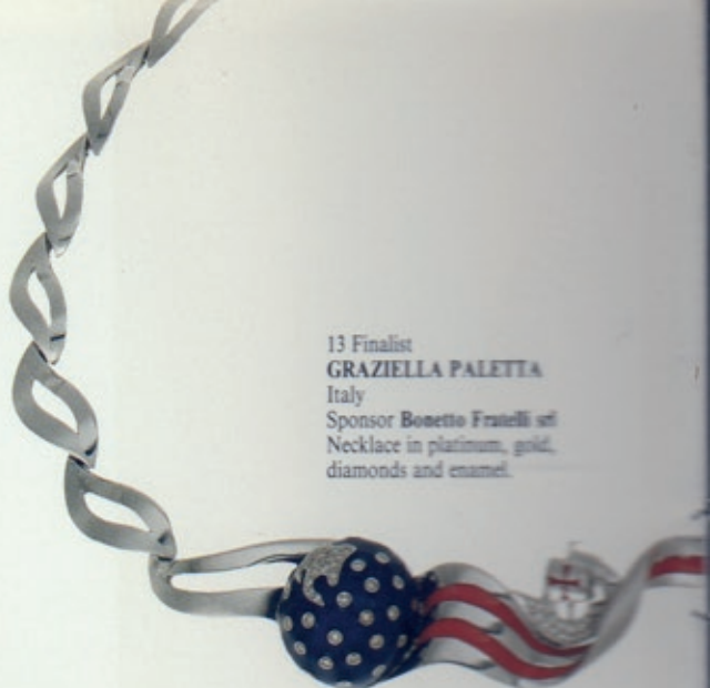
13 Finalist GRAZIELLA PALETTA Italy Sponsor Bonetto Fratelli srl Necklace in platinum, gold, diamonds and enamel.