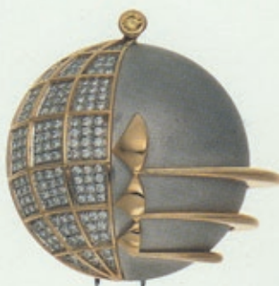
18 Finalist CLARA DODINO Italy Sponsor Tradico Silvio Brooch of platinum, gold and diamonds.